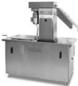
AFWP-10 10 Hp Food Waste Pulper