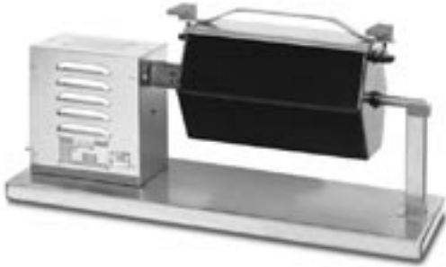
ABR-120 Tabletop Rotary Silverware Burnisher