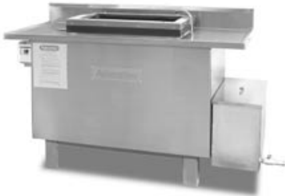
ABV-300 Vibratory Silverware Burnisher