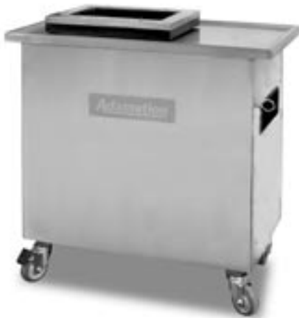
ABV-125 Vibratory Silverware Burnisher

Price is for 110V/Single phase/60Hz model. For other voltages, or 50Hz, add $80